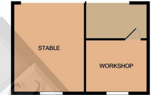
STABLE & WORKSHOP